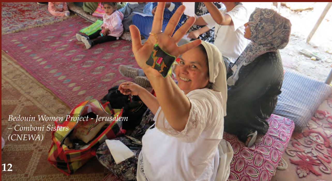
Bedouin Women Project - Jerusalem – Comboni Sisters (CNEWA)

In 2024, a total of 64 projects were implemented in the health, education, and social service sectors which reached thousands of people in Palestine.