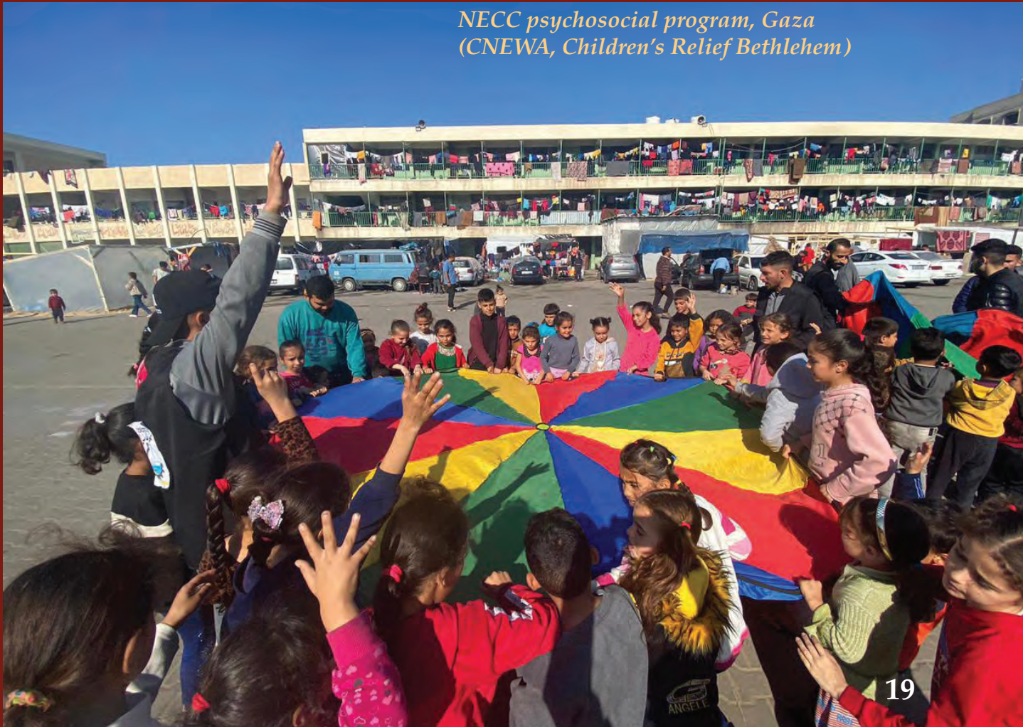
NECC psychosocial program, Gaza (CNEWA, Children's Relief Bethlehem)

With the support of CNEWA, annual subsidies were allocated towards 3 health and education programs of local partners reaching a total of 11,546 children and adults in the Gaza Strip and in Bethlehem.