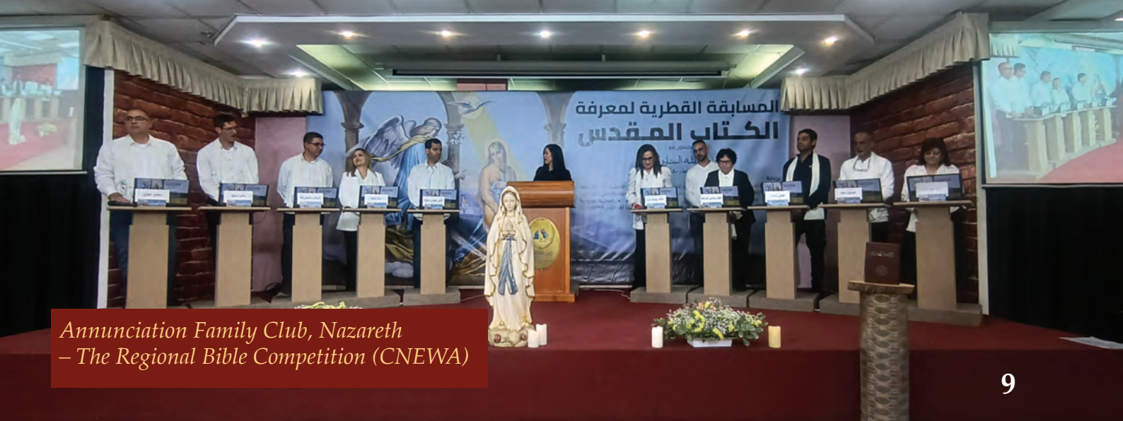
Annunciation Family Club, Nazareth – The Regional Bible Competition