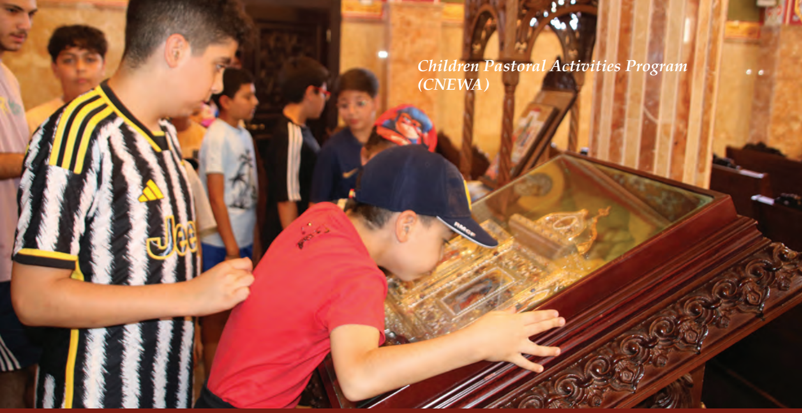
Children Pastoral Activities Program (CNEWA)