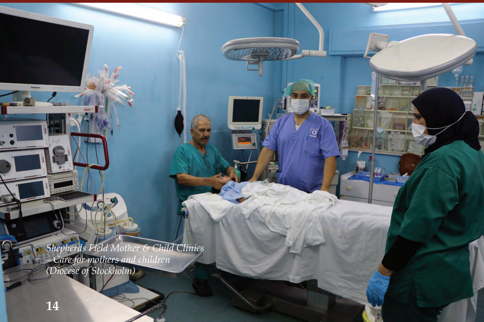
Shepherds Field Mother & Child Clinics - Care for mothers and children (Diocese of Stockholm)

- Covered the costs of check-ups for 250 newborn babies in the pediatric clinic of Shepherd's Field Hospital, a local healthcare institution under Beit Sahour Cooperative Society for Health Welfare. Thanks to this generous grant, health monitoring services were conducted, including the successful delivery of 25 deliveries of poor women, the distribution of 250 multivitamin units and 300 vitamin D drops for pregnant women and babies, 250 CBC and HBAIC blood tests, 99 iron deficiency for newborns, and doctor's fees for deliveries and home visits of 15 new mothers to ensure the health and welfare of both mother and child.