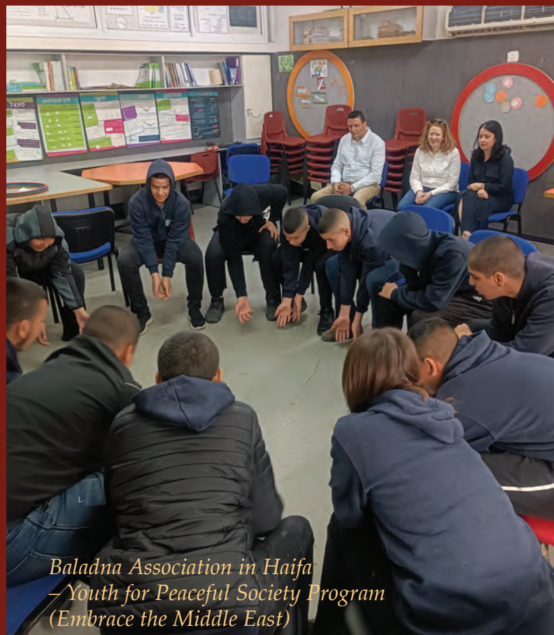
Baladna Association in Haifa – Youth for Peaceful Society Program (Embrace the Middle East)