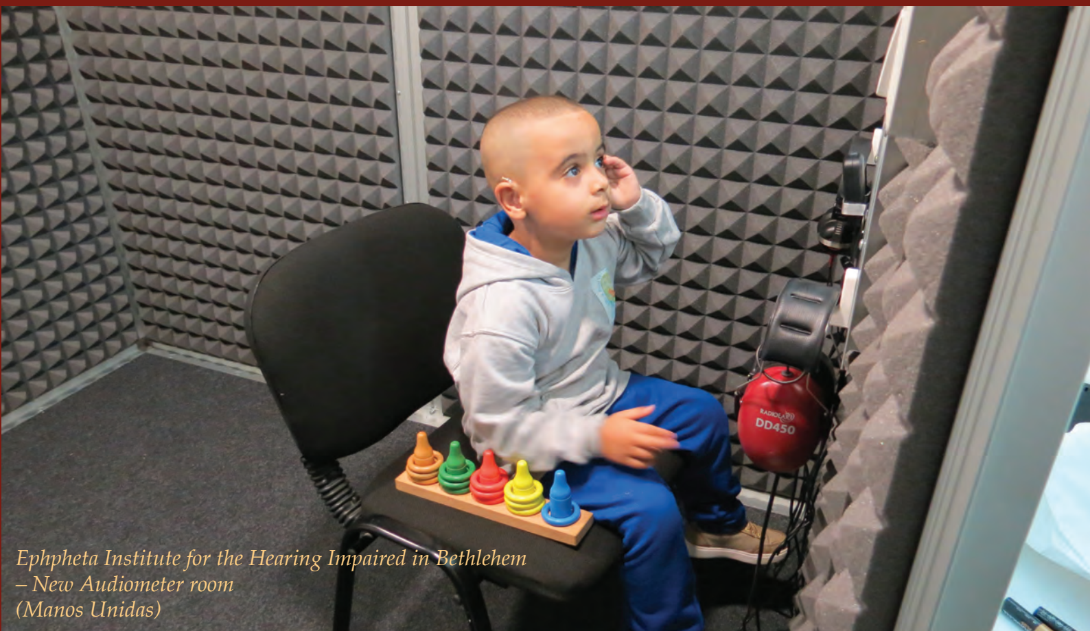
Ephpheta Institute for the Hearing Impaired in Bethlehem – New Audiometer room (Manos Unidas)