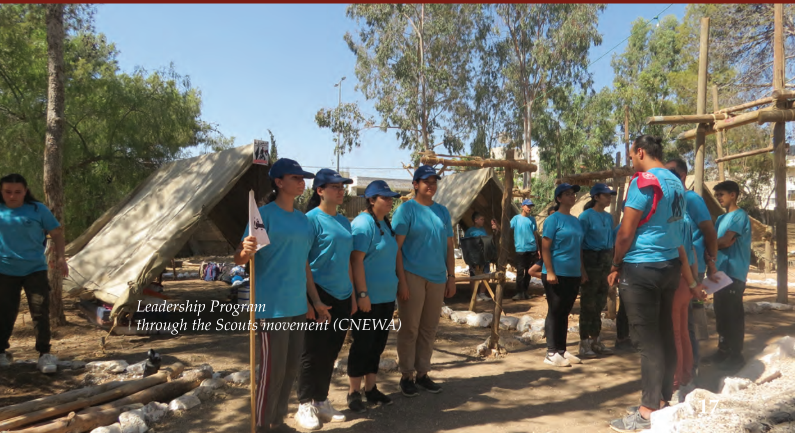
Leadership Program through the Scouts movement (CNEWA)