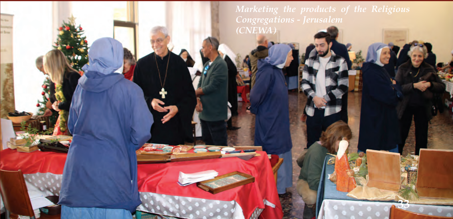
Marketing the products of the Religious Congregations - Jerusalem (CNEWA)