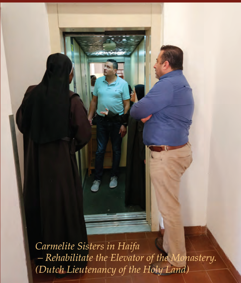
Carmelite Sisters in Haifa – Rehabilitate the Elevator of the Monastery. (Dutch Lieutenancy of the Holy Land)